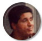
Anthony "Gaspape" Casso