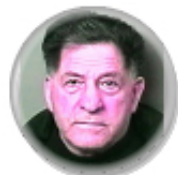
John "Sonny" Franzese