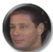
Salvatore "Bull" Gravano