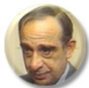
Carmine "Junior" Persico