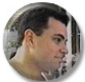
John "Junior" Gotti