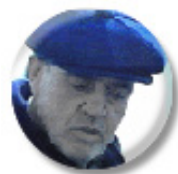
Vincent "Chin" Gigante