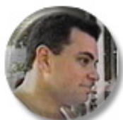
John "Junior" Gotti